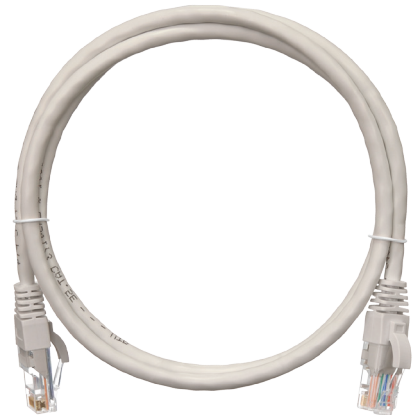
NMC-PC4UE55B-XXX-C-ZZ - LSZH NMC-PC4UE55B-XXX-ZZ - PVC U/UTP, Cat.6, RJ45-RJ45