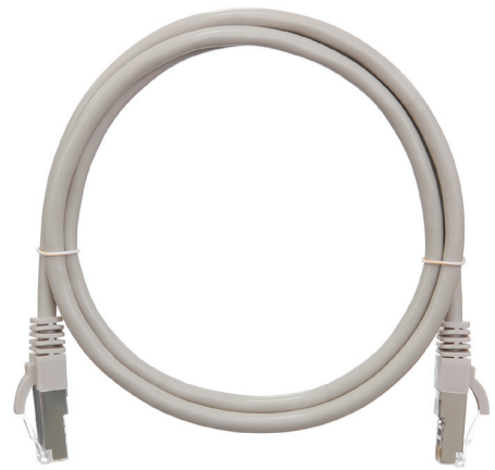
NMC-PC4SE55B-XXX-C-ZZ - LSZH NMC-PC4SE55B-XXX-GY - PVC S/FTP, Cat.6, RJ45-RJ45