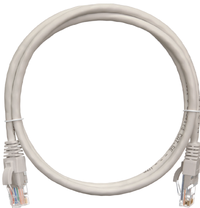
NMC-PC4UD55B-XXX-C-ZZ - LSZH NMC-PC4UD55B-XXX-GY - PVC U/UTP, Cat.5e, RJ45-RJ45