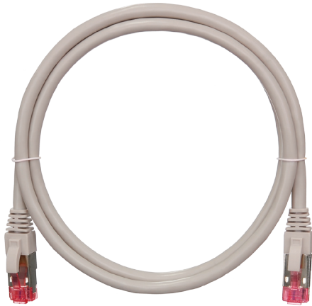
NMC-PC4SA55B-XXX-C-ZZ - LSZH NMC-PC4SA55B-XXX-ZZ - PVC S/FTP, Cat.6A, RJ45-RJ45