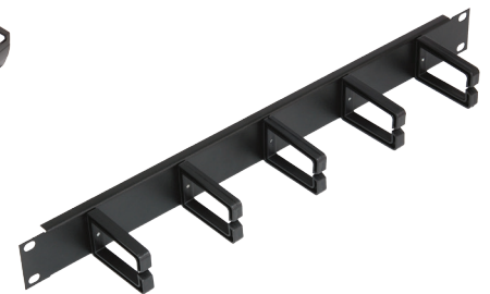
NMC-OP450-2 Rings 60 mm