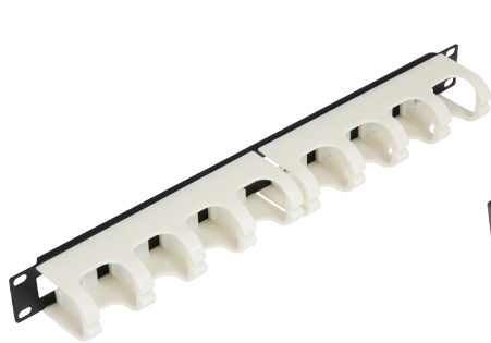
NMC-OP110 110 type, ring 48 mm

NMC-OP450-2: Cable management panel - 2 pcs.