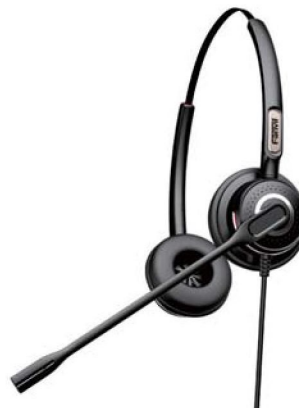
Fanvil - HT202