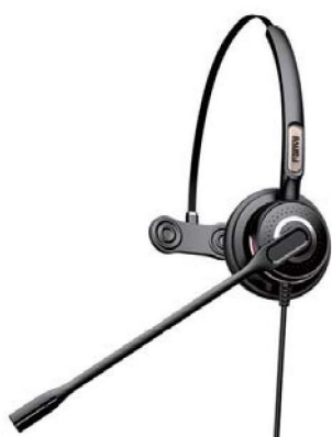
Fanvil - HT201

Fanvil HT201 & HT202 offer a range of premium quality headsets using Fanvil's innovative acoustic technology to deliver speech clarity and an excellent audio experience. Coupled with our sleek design that focuses on comfort and durability, the Fanvil HT201 & HT202 headset offers a new level of experience for call center professionals.