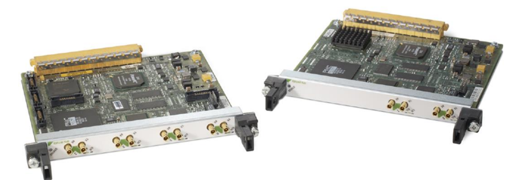
Figure 1. Cisco 4- and 2-Port Clear Channel T3/E3 SPAs Version 2

The Cisco Interface Flexibility (I-Flex) approach combines SPAs and SPA interface processors (SIPs), providing an extensible design that enables service prioritization for data, voice, and video services. Enterprise and service provider customers can take advantage of improved slot economics resulting from modular port adapters that are interchangeable across Cisco routing platforms. The Cisco I-Flex design maximizes connectivity options and offers superior service intelligence through programmable interface processors that deliver line-rate performance. I-Flex enhances speed-to-service revenue and provides a rich set of quality-of-service (QoS) features for premium service delivery while effectively reducing the overall cost of ownership. This data sheet contains the specifications for the Cisco 2- and 4-Port Clear Channel T3/E3 SPAs Version 2 (Figure 1).