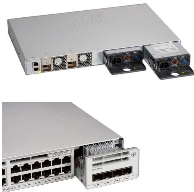
Figure 3. Cisco Catalyst 9200 Series Switch dual redundant power supplies