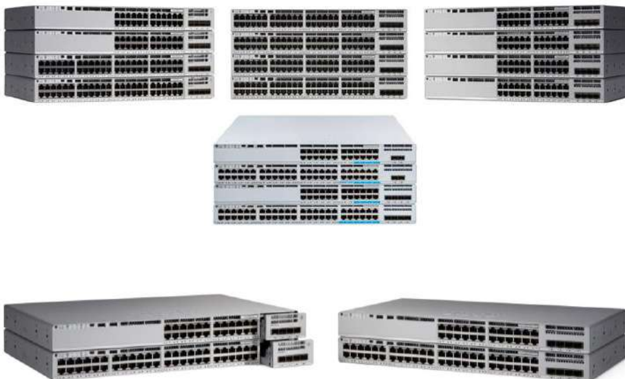
Figure 1. Cisco Catalyst 9200 Series switches

The Cisco Catalyst 9200 Series is made up of modular (C9200) and fixed (C9200L) switch models.