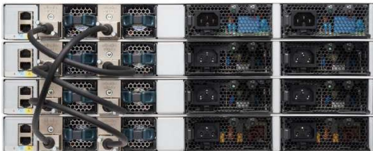
Figure 4. Cisco Catalyst 9200 Series Switch stacked units